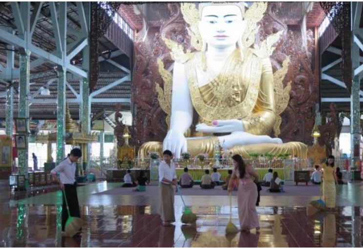
Our team sweeping at the praying area of the Ngar Htet Gyi Pagoda.

The sitting Buddha is a historic feature of this pagoda that dated back to the year 1558. The Buddha image is housed in a pavilion of iron structure with a five-tiered roof. Hence Ngar-Htat-Kyi Pagoda also means the pagoda with five-layered roof.