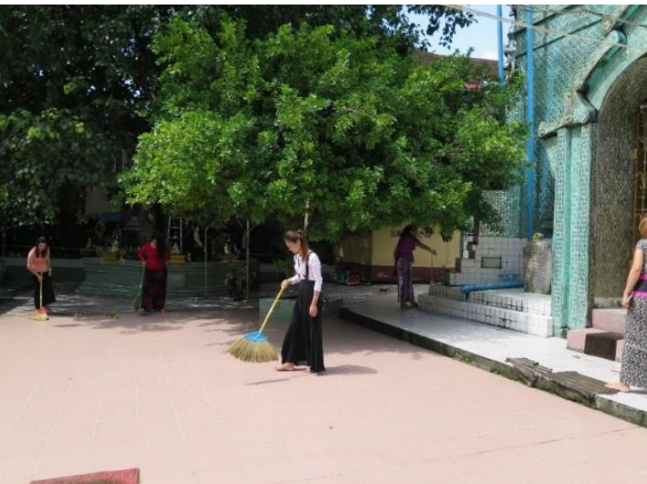
The team sweeping at the walkways of the Sein Yaung Chi Pagoda under the hot sun.

The Sein Yaung Chi Pagoda, meaning “Diamond Reflections”, was named according to its wonderfully beautiful structure. The green tiles and mirrored scales covering the body of the pagoda reflect the sunlight which makes the pagoda look stunning during the day.