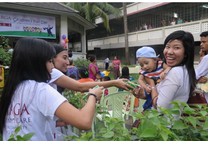
Happy faces of children and their guardians participating in our children's fun day event