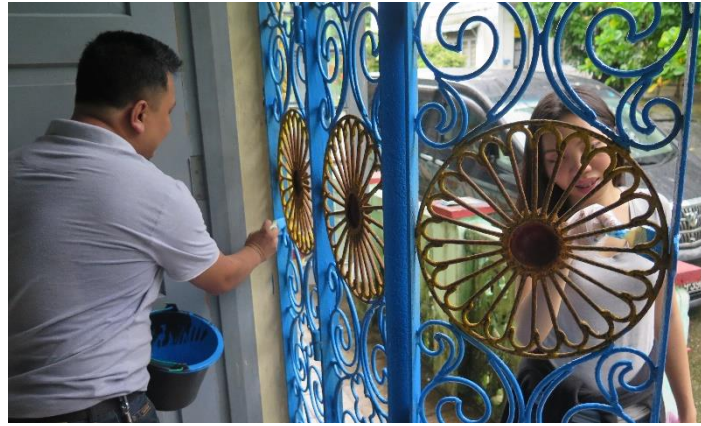
The weather was really nice, a perfect day for painting.

The over-30-year-old Pyinsanikaya Monastery is located on a 6.5-acre compound in Yankin Township. The monastery is comprised of numerous buildings and houses a number of sayadaws and scholar-monks. Maintenance of the monastery is not easy, given its size. As soon as our company learnt about the need for maintenance of the monastery's assembly hall that frequently holds Dhamma talks and ceremonies with attendance by hundreds of pilgrims from the neighborhood and from other parts of Yangon, we promptly responded by donating the necessary cost for the repainting and repair and arranged for a site inspection by a professional contractor. Although much of the repainting works will be done by the professional workers, the MCC team was eager to offer a hand as a way to pay respect to the decades-old establishment.