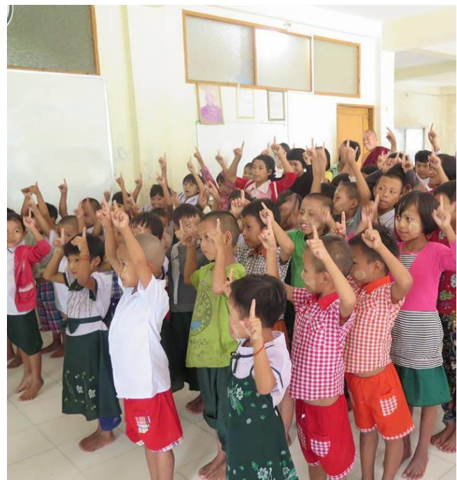
The group who had the best dance moves got the grand prize.