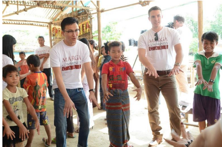
Together, we can put rays of hope on the faces of these children in spite of their poor conditions.