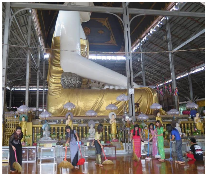
Our team sweeping the praying area of Ko Htet Gyi Pagoda.

The 72 feet sitting Buddha image was built in 1905. At the entrance of the hallway, there is a statue of a frog and a snake. According to legend, the frog ate the snake and claimed victory, hence the Buddha image was built on this piece of land. The MCC team was fascinated by the legend and found it a special experience to offer our service to this pagoda.