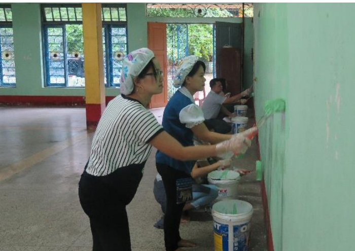
Despite their first experience, the team did a decent job.