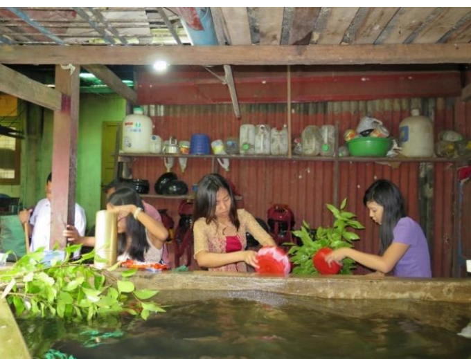
The girls cleaning vases which are placed at the Buddha shrine.