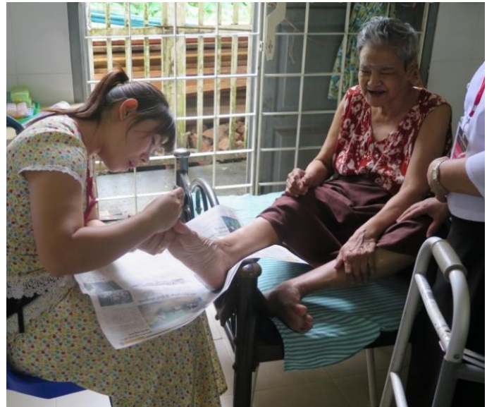
A grandma enjoying the service from our team member.