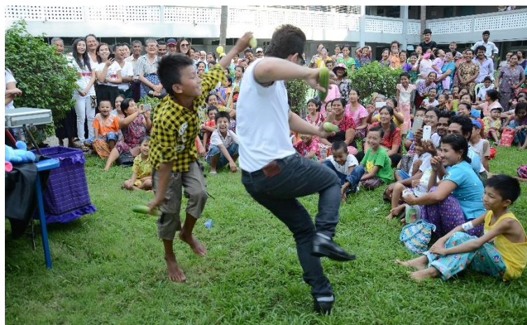
A magical dance performed together with the magician and a volunteer kid.

We started off the day's program with two Hello Kitty cartoon characters leading the participants to a warm-up dance to the famous nursery rhyme "Old MacDonald Had A Farm." The first highlight of the program was the dance competition in which 10 pairs of child-parent "dancers" competed with one another. All the teams had so much fun even though only two could win the prize. After the action, the participants were all drawn into the