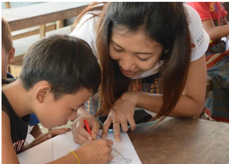
One of our MCC team helping kids with the coloring.