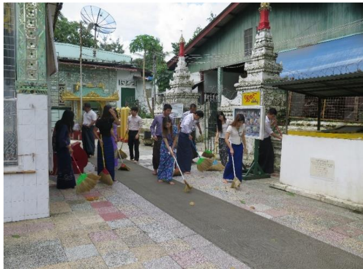
The team sweeping at the corridor of the Moe Kaung Pagoda.

The Moe Kaung Pagoda, located in the Yankin Township. The MCC team swept the walkways, the corridor and the praying area of the pagoda with the good wish for the visitors of the pagoda to be able to worship and walk in the clean pagoda premises.