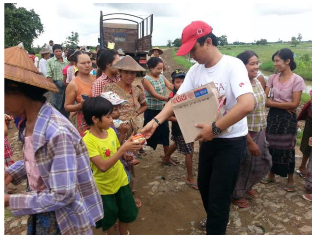
MCC team member passed the relief supplies to flood victims at Pay-Gone Village, Kantbalu Township.

More than 3800 units of medicine for diarrhea, cold & flu, water purification tablets and rehydration salts (dat-sarhtoke), 2700 units of nutritional drinks, noodles, and more than 230 pieces of clothes were directly handed over to the victims.