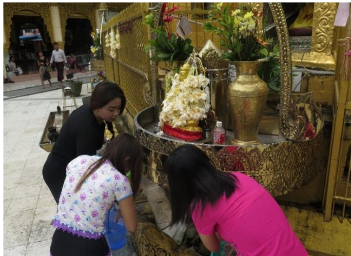
The team refilling the urn with water.

The Shwe Hpone Pwint Pagoda is the only pagoda in Yangon which opens from 4 am to 11 pm. It is located in Pazundaung Township, one of the most crowded townships in Yangon. It is located within the dense neighborhood of many households, hence it is frequently visited by people living nearby. On special days, it is crowded with pilgrims and donors.