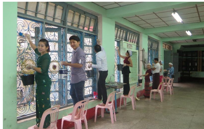
The team had a good time offering helping hands in restoring sacred Buddhist establishment.