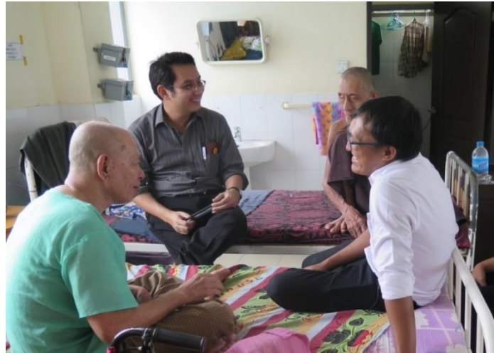
The grandpas sharing their life stories with our team members.