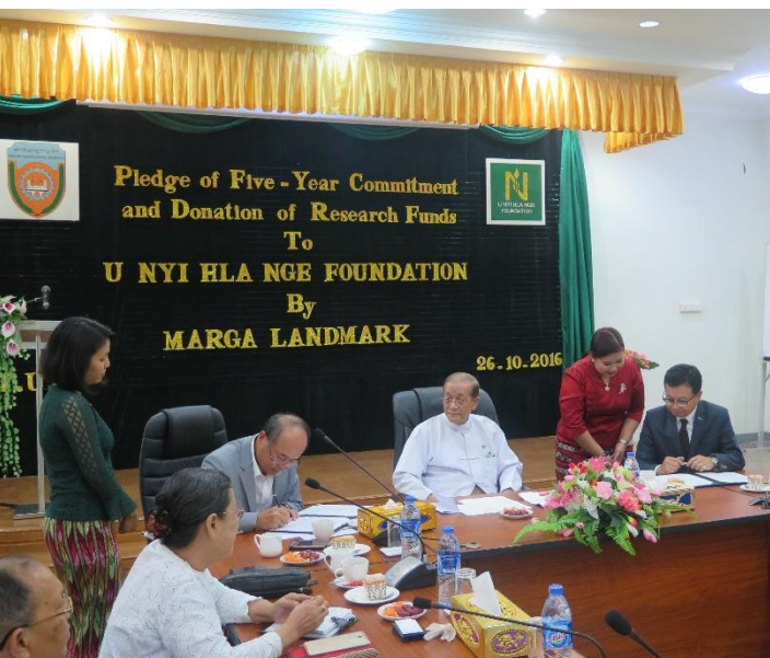
A donation and agreement signing ceremony was held at YTU to formally kick off Marga Group's long-term sponsorship for research fund for students from YTU.