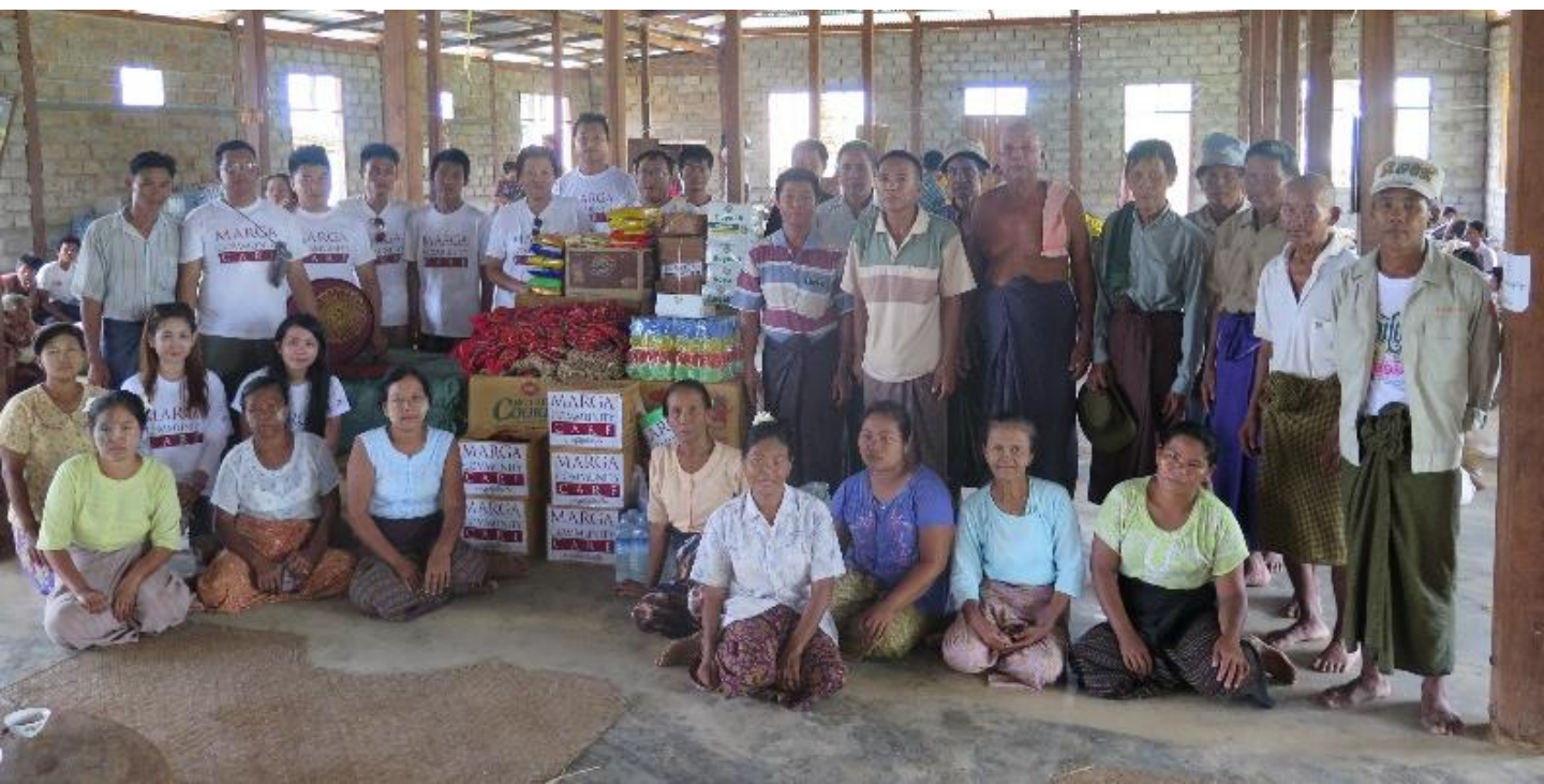
MCC flood relief team with the flood victims at one of the shelters.