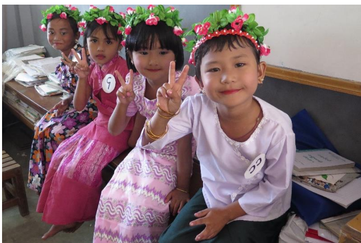
Super cute kids waited excitedly to show off their talents at the "beauty pageant"

Children's laughter filled the outdoor playground when we staged the fun games with two traditional games Arr-Lu-Kout (collecting potatoes) for boys and Za-Gaw-Ywat (walking with the plates on the head) for girls. The children were so loud that even other families in the neighborhood came into the school to enjoy the fun.