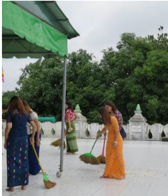
Our team sweeping at the walkways and praying area of the Alan Pya Pagoda.

Out of utmost respect for our Buddhist establishments, the Marga Community Care team has started the mission of sweeping and cleaning the compound of a different monastery or pagoda every week since July 2015. Our team feels particularly happy to be able to offer our service. Wherever our “sweeping team” goes, we feel the warm welcome from the monks or nuns living there. We are often treated with lunch and sometimes have the honor of listening to the wise teachings by the revered monks.