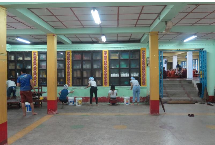
The team pride themselves on giving back to community.

In consideration of the need of the monastery as well as the seasonal factor, we decided to finish the repainting in two phases with the first that targeted on the interior of the assembly hall to be finished during the rainy season. The last phase would be completed when the dry season returns with focus on the exterior of the hall so as to prevent the new paint from being washed away by the torrential rains that are common in the wet season.