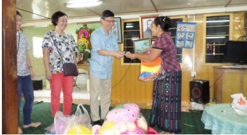
A representative from Marga Senior Management giving the cash and gift donation to the guardian.

The MCC team visits different orphanages and child care centers on a regular basis because we firmly believe that every child deserves care and affection regardless of their backgrounds.