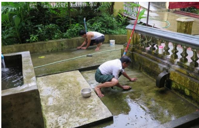
Our team scraping weeds at the area where the monks take bath.

In August, the MCC team paid our first visit and noticed that the monastery is deficient of proper cleaning. The team cleaned the hall where the monks take rest, the basement of the monastery, and the bathroom area of the monastery.