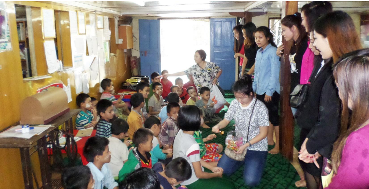
The team distributing the small gifts to the children.