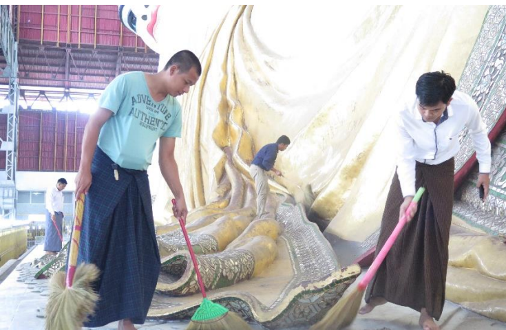
Our team sweeping at the area which can only be entered by males at Chauk Htet Gyi Pagoda.