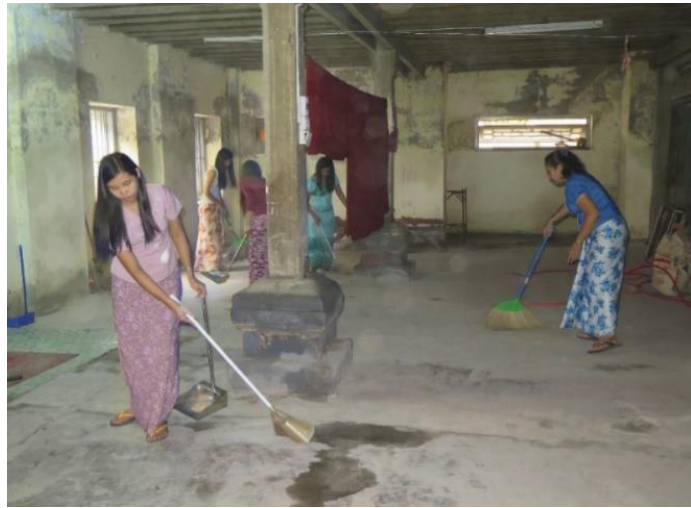
Our team sweeping at the basement of the Danyawati monastery.

This monastery is one of the monasteries that Marga has been donating lunch. The team never has a chance to have the service merit at this monastery though. Therefore, we extended our acts of good deeds by sweeping and cleaning around the premises in July.