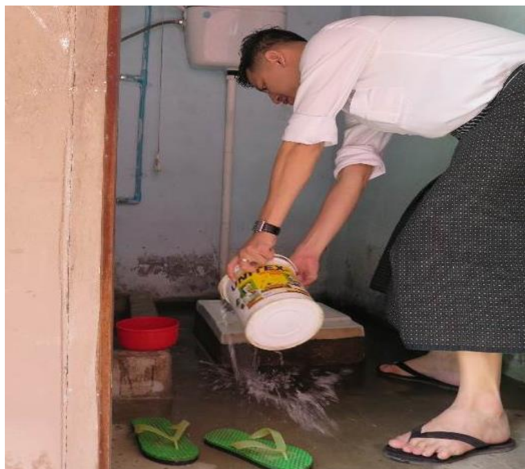
Our team member cleaning the bathroom area of the monastery.