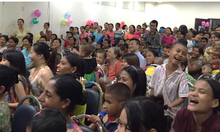
The children and their parents had a fun time together.

An atmosphere of joy and peacefulness filled the packed conference room as the 10-people string ensemble from Orchestra for Myanmar played happy tunes for the audience. When the MCC team sang the familiar “Moe” song to the melody played by the orchestra, the parents and the older children sang along and clapped.