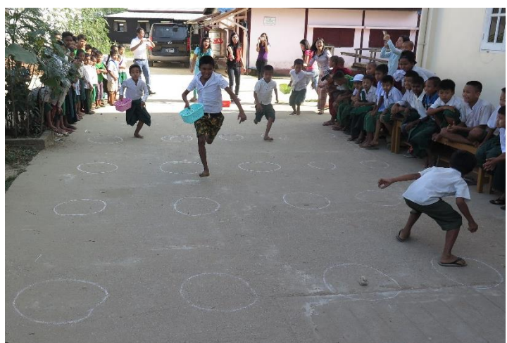
Look who is the fastest collector of potatoes!